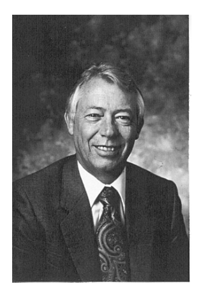
Figure 5.5: A.C. (Mike) Markkula, Jr.