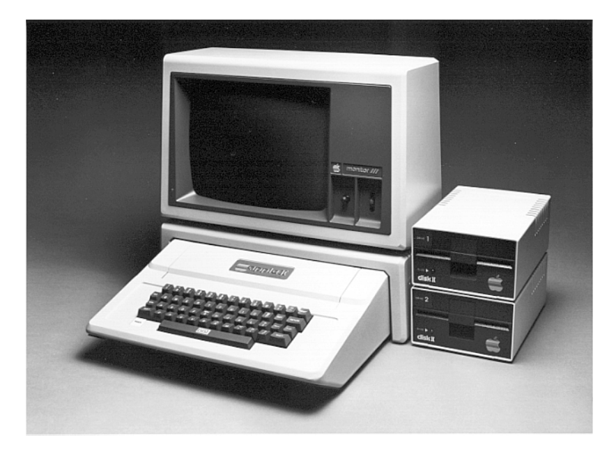
Figure 5.2: Apple II computer, monitor and two disk drives.

Some Apple II boards shipped around May 1977 and the Apple II computer was available to the general public by June at a price of $1,298. The company offered Apple I board owners the option of upgrading to the new Apple II computer. Apple sold about seven thousand Apple II's by the end of 1977.