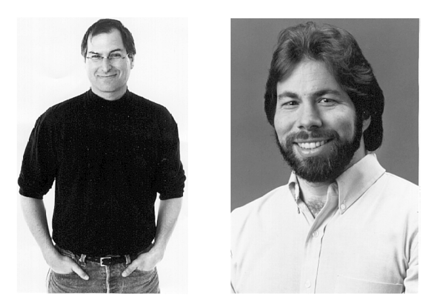
Fig. 5.3: Steven P. Jobs. Fig. 5.4: Stephen G. Wozniak.